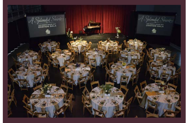
Rosie's House 2017 Ovation Gala

Click HERE for Audited Financial Statement for Fiscal Year 2017.