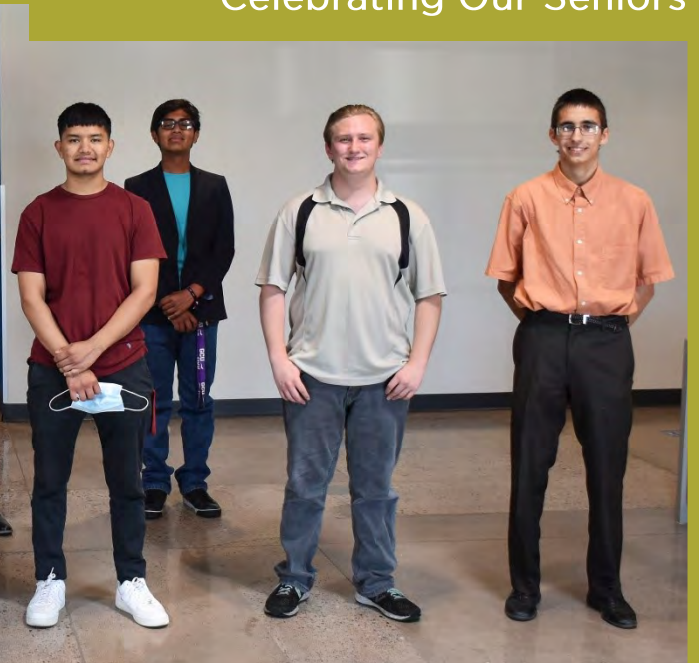
Some of the graduating seniors at the end of year graduation celebration.