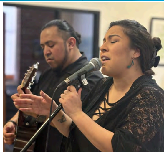
LuMar at Xico