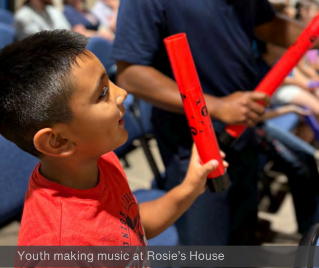
Youth making music at Rosie's House