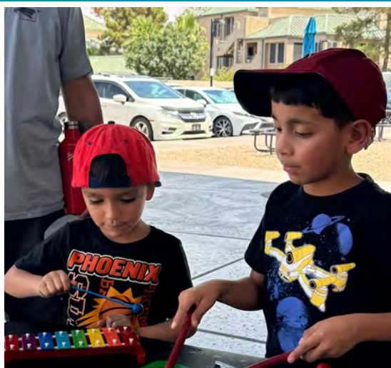
Youth at Children's Museum of Phoenix