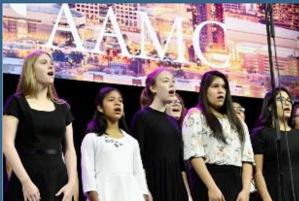
The Advanced Choir performs at the AAMC annual conference

Last year was an exciting year filled with many unique performance opportunities. Students performed at over 60 Rosie's House events like concerts, Signature Events and even virtual recitals. There were also several opportunities for students to perform in the community through key partnerships.