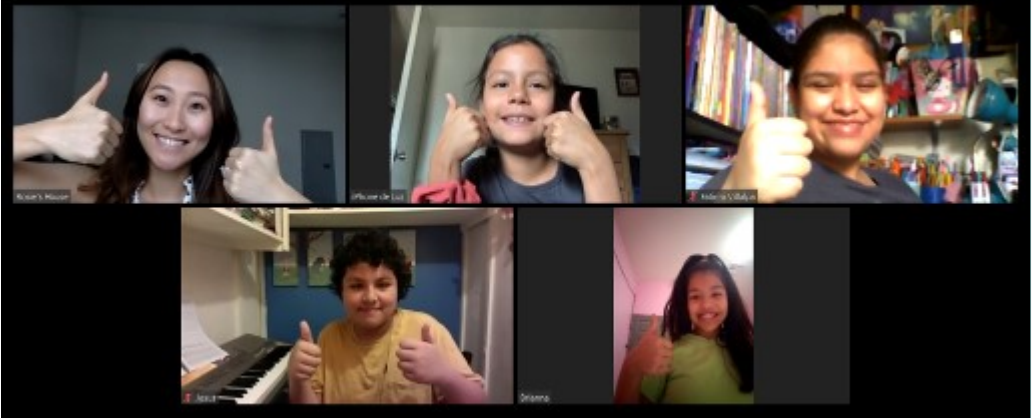
Rosie’s House students give a thumbs up for their virtual piano classes.

The 2019-2020 year proved again that Rosie’s House has a generous and supportive community. When programs needed to be adapted to a virtual format that caused increased and unexpected costs, several supporters stepped in to ensure that students still had access to high-quality music education from their homes all across the Valley.